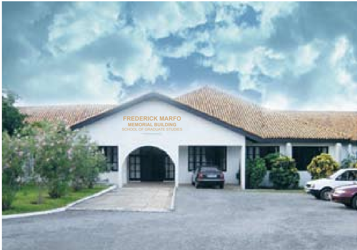
FREDERICK MARFO MEMORIAL BUILDING SCHOOL OF GRADUATE STUDIES