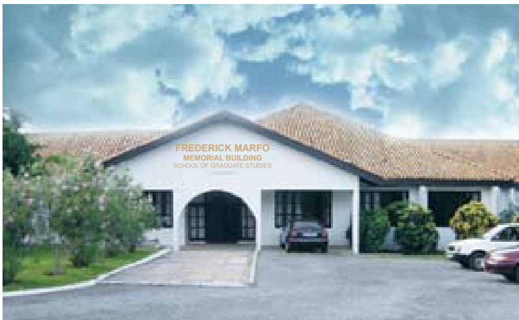
School of Graduate Studies

COURSE DESCRIPTIONS OF PROGRAMMES IN THE SCIENCES