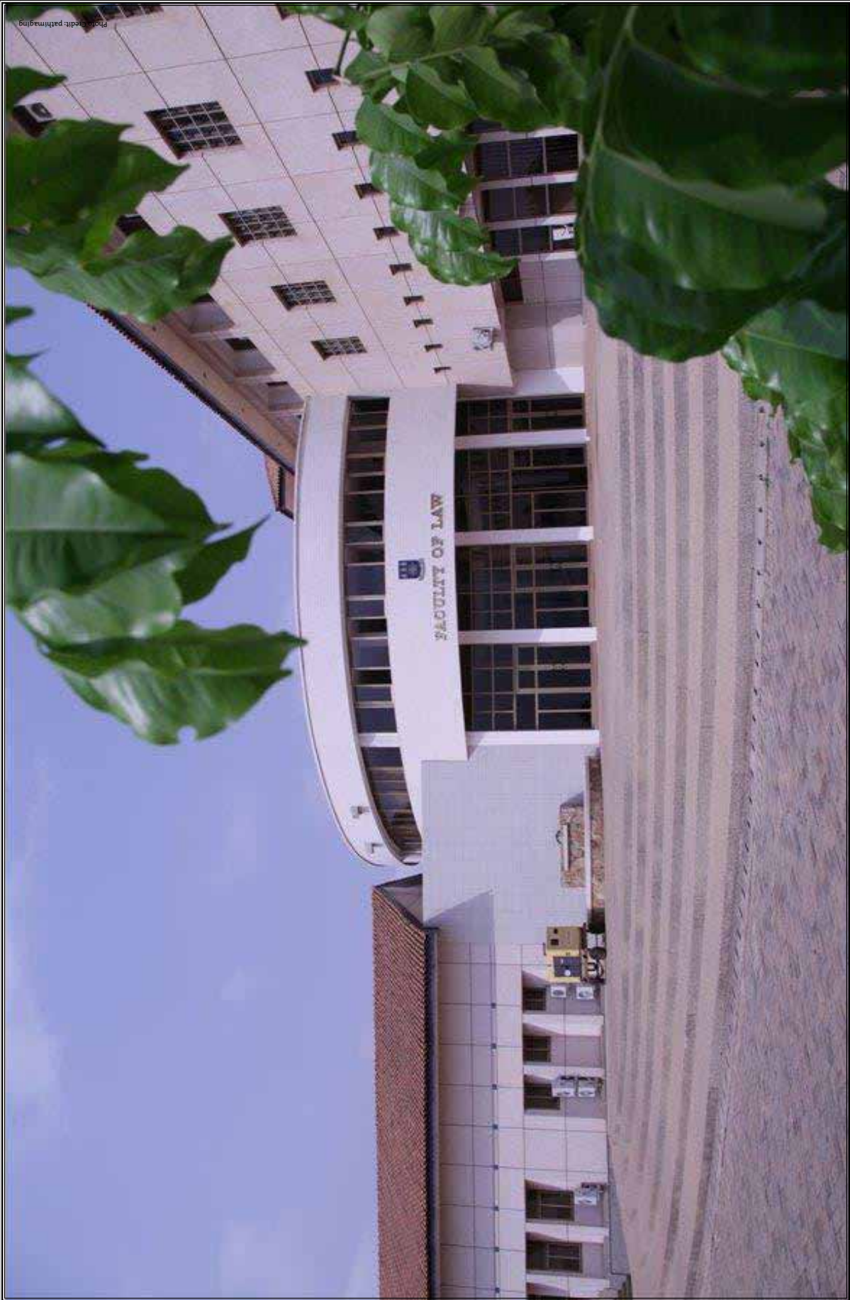
Faculty of Law, Legon Campus