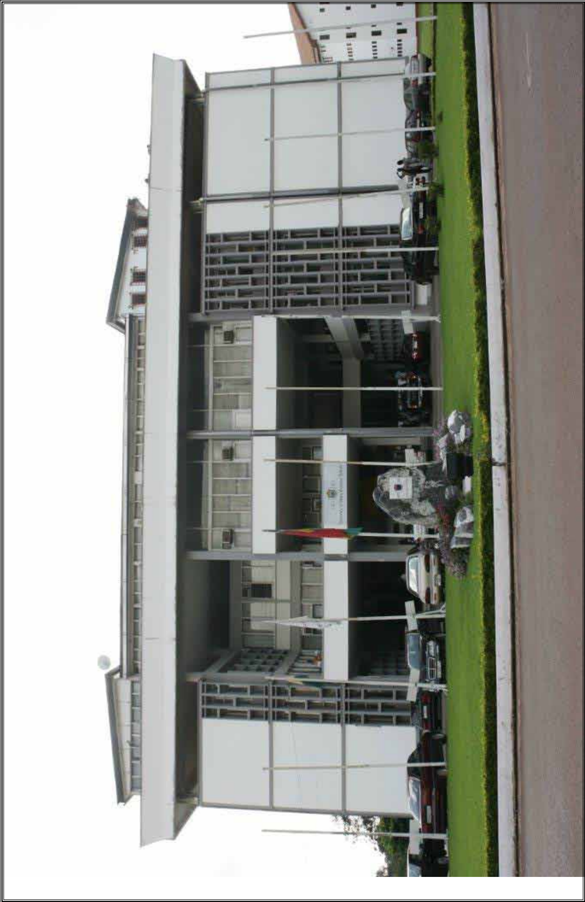
University of Ghana Business School, Legon Campus