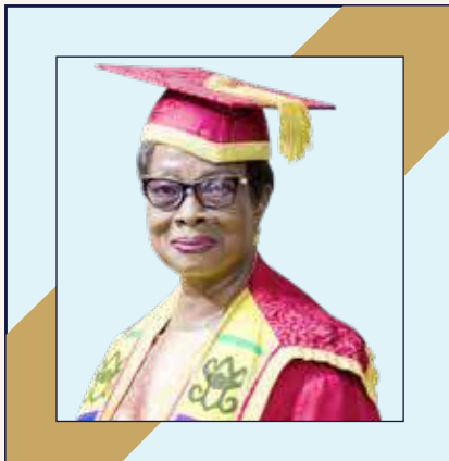
Justice Sophia A.B. Akuffo (Rtd.) Chairperson, University Council