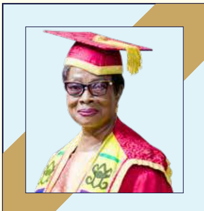
Justice Sophia A.B. Akuffo (Rtd.) Chairperson, University Council