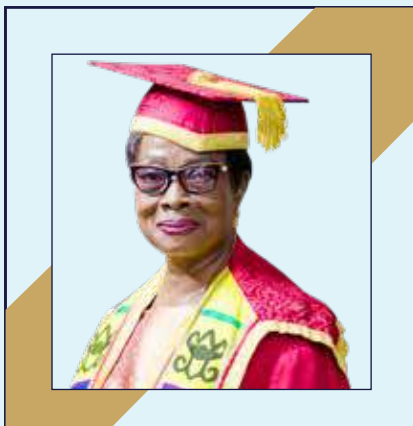
Justice Sophia A.B. Akuffo (Rtd.) Chairperson, University Council