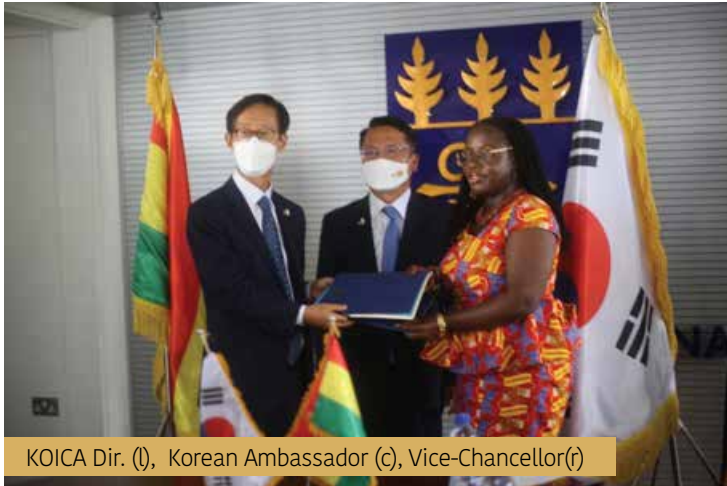
KOICA Dir. (l), Korean Ambassador (c), Vice-Chancellor(r)