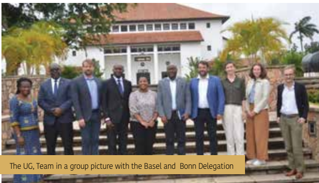
The UG, Team in a group picture with the Basel and Bonn Delegation