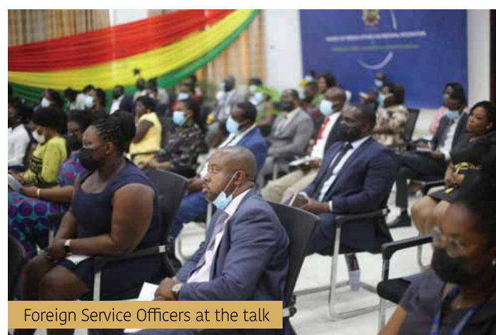
Foreign Service Officers at the talk

na Relations on 23rd March, 2022. The ministry is a major stakeholder of CAS. This is the second time CAS has provided training inputs for the Republic's Senior Foreign Service Officers.